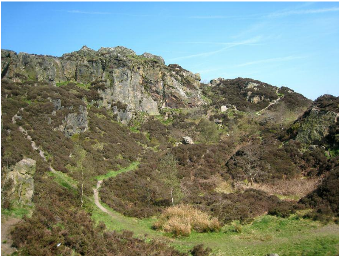
Fig. 3 a general view of the Mow Cop quarry,

To finish we had a look at the Old Man of Mow (Fig. 4). This is a 65ft high, un-quarried stack of rock dating from about 1530. Why? One theory is that it was poor quality stone because it is on the edge of the Mow Cop fault. Another is that it was left to support machinery.