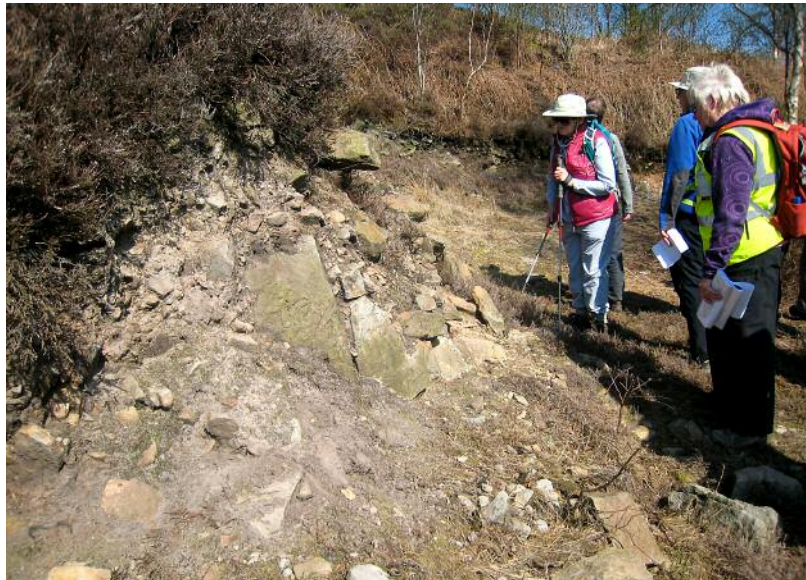
Fig. 2 inspecting the waste at GR873592.

However, nothing was found that was not local and there is a large quarry just over the top of the hill. So we decided it must be quarry waste that had been tipped over the edge. We then walked a short way along the footpath at the top of the quarry, which is in massive sandstone and by the footpath the bedding is very steep to vertical.