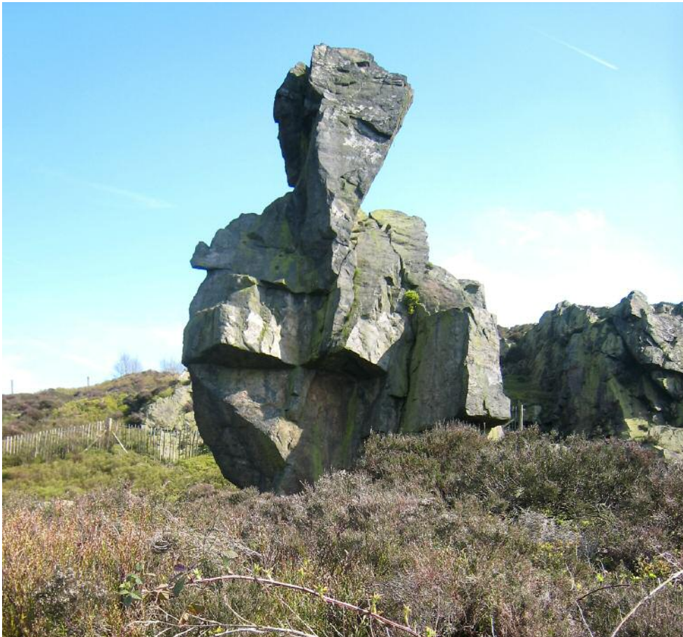
Fig. 4 the Old Man of Mow

This was a very interesting day relating the geology to its changing exploitation over time and, therefore, to the presence of settlements. The trip also added to previous MGA trips to Teggs Nose and Bosley Cloud.