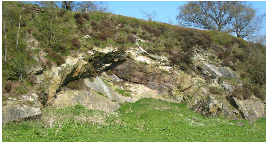
Fig. 1 the quarry at GR 870589.

We walked down to a quarry (Fig. 1) (GR870589) in the Chatsworth Grit (cf Teggs Nose above Macclesfield) where the beds dip at 60°. From here we could see the Red Quarry on Bosley Cloud and the glacial sediments on its flanks, which are much unconsolidated. Bosley Cloud is at the apex of a southerly, plunging, asymmetric syncline on a large scale anticline. Our next stop was at GR873592 (Fig 2); here too the sediments are unconsolidated. So is the outcrop by the quarry waste or glacial? It is of angular, broken up material and is the correct height for a glacial deposit.